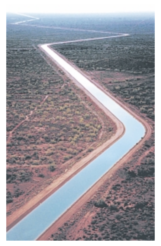
Central Arizona Project Canal, west of Phoenix, Arizona.

The answer is simple—The salts go where the water goes, and they accumulate in soils where evapotranspiration (combined evaporation from soils and transpiration by plants) exceeds combined precipitation and irrigation. For south-central Arizona, salts accumulate in irrigated agricultural and urban areas (parks, golf courses, and residential yards). The water that is returned to the atmosphere by evapotranspiration essentially is distilled water, leaving the