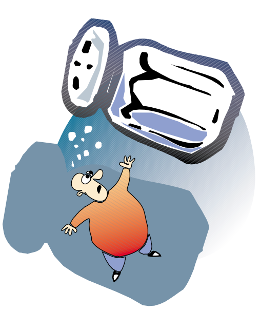
The total imported salt load in south-central Arizona equals about 900 pounds of salts per person per year!

Natural processes add salts to surface water and ground water. The concentration of salts in water is determined by many factors including reactions with minerals in the soil and rock formations across which and through which the water moves. For example, the average dissolved-solids concentration of the Salt River as it enters the Salt River Valley east of Phoenix (Salt River below Stewart Mountain Dam) is