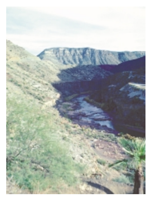
Salt River, east of Phoenix, Arizona.

"dissolved-solids concentration" in milligrams of dissolved salts in one liter of water (mg/L). Water with a dissolved-solids concentration of less than 500 mg/L-about a quarter of a teaspoon of salts per gallon of water—generally is suitable for most uses (Swenson and Baldwin, 1965). Water may have a mineralized or salty taste when the dissolved-solids concentration exceeds 500 mg/L, which is the Federal secondary maximum contaminant level for drinking water (U.S. Environmental Protection Agency, 1994). At concentrations greater than 2,000 mg/L, water generally is unsuitable for many uses including longterm irrigation (Swenson and Baldwin, 1965). The salts that constitute a major part of the dissolved-solids concentration in waters of south-central Arizona are calcium, magnesium, sodium, sulfate, chloride, and bicarbonate. Concentrations of nitrate, fluoride, and trace metals such as arsenic or selenium are particularly significant because they affect the suitability of water for certain purposes (Hem, 1985).