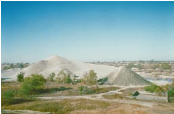
Lead-zinc mining tailings near Joplin, Mo. Downstream from mining areas, concentrations of lead, zinc, and other elements generally are relatively low in water but are elevated in bed sediment and in fish and clam tissue. In bed sediment, concentrations at some locations may be harmful to aquatic wildlife.

were not higher than background concentrations at sites in the Viburnum Trend, but were somewhat higher than background concentrations at sites in the Tri-State District and downstream from the Old Lead Belt. The elevated lead and zinc concentrations in tissue and reduced enzyme activity in fish exposed to lead in mining areas of the Ozark Plateaus (Schmitt and others, 1993) suggest that both elements are available to fish and Asiatic clams for biological processing. The State of Missouri currently (1998) advises the public to not eat some species of fish from some rivers affected by past mining in the Old Lead Belt (Gale Carlson, Missouri Department of Health, written commun., 1998).